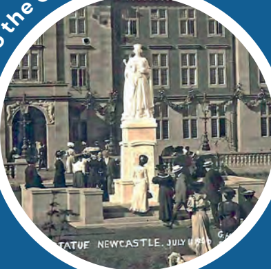
Giving to the City p14