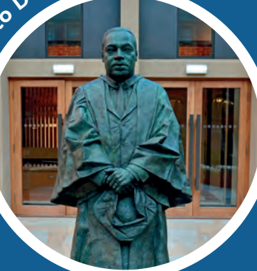
The Road to Democracy p11