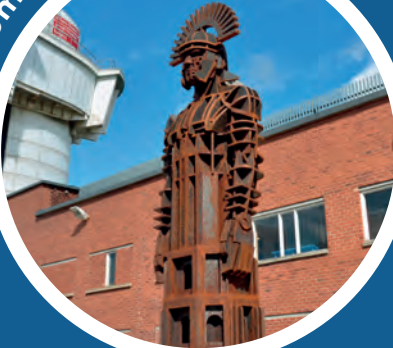
Tales from the Riverside p14